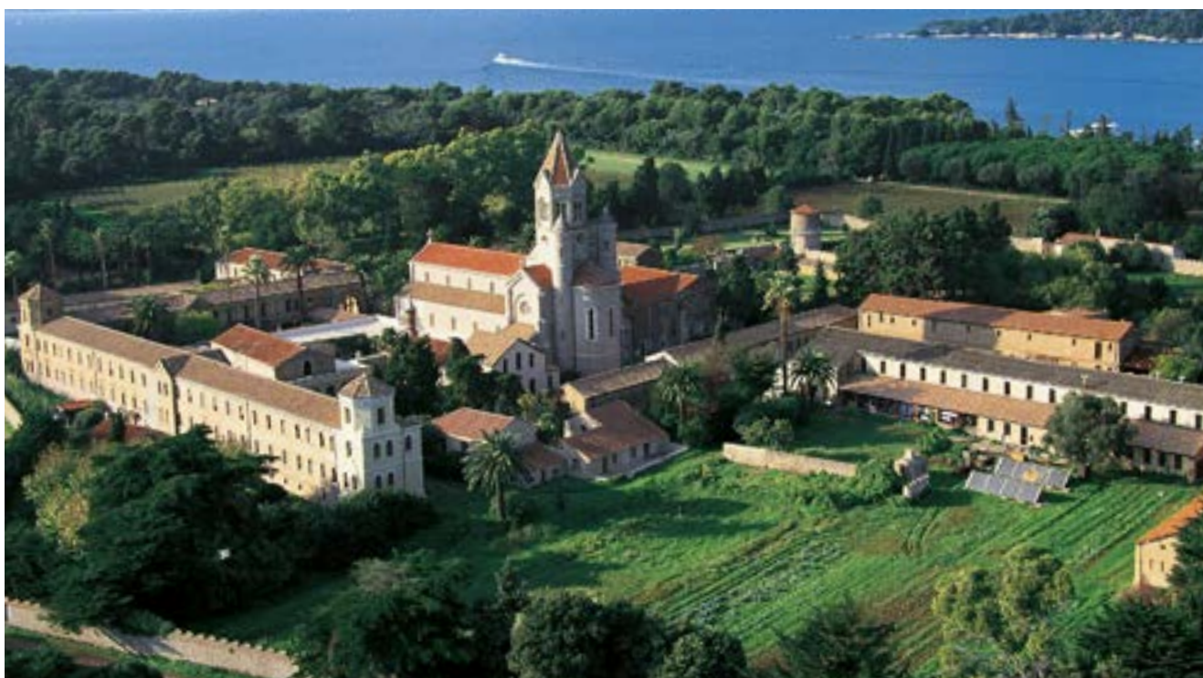
St Honorat Island

Guests will follow the paths under the pines and explore the island, whose centre is occupied by the monastery's vineyards, from which the monks draw wines and liqueurs, and where a wine tasting will take place during our tour.