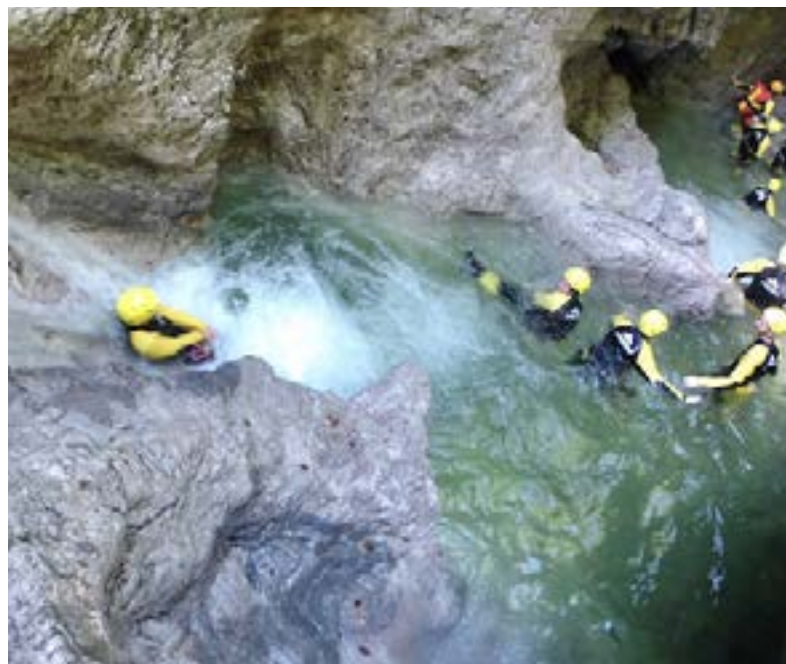
Gorges du Loup

This activity is accessible to anyone in good physical condition who is able to swim (medium difficulty).