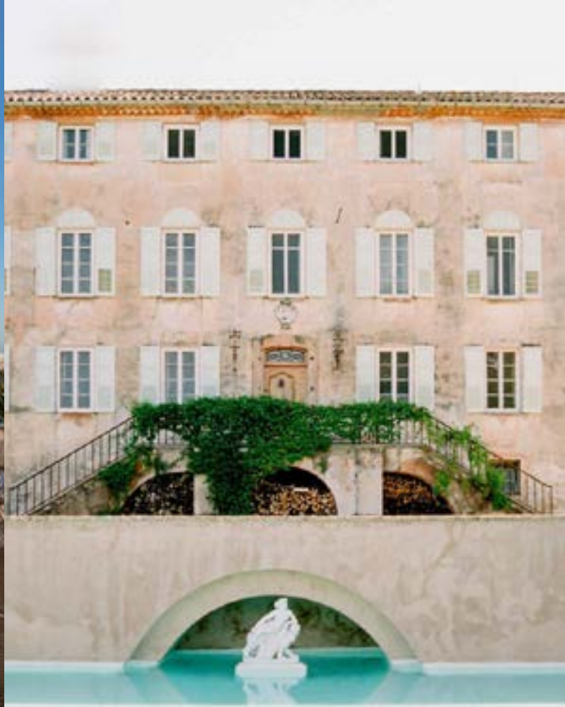
La Bastide du Roy